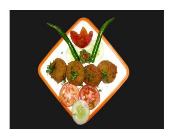
Fig:2 Fish Cutlet